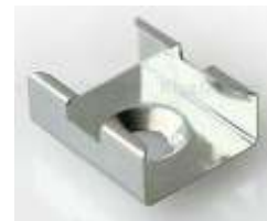
mounting bracket zinc (1399) chrome matt (1455)