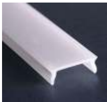
cover type K frosted (1547) transparent (1548)