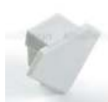
end cap without hole (1383) with hole (1440)