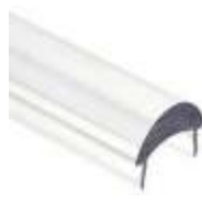
cover type S (00220)