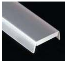
cover type HS frosted (1369) transparent (1370)