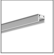
REGULOR Extrusion Ref: B468+43ANODA