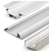
Mounting Hardware & Extrusions