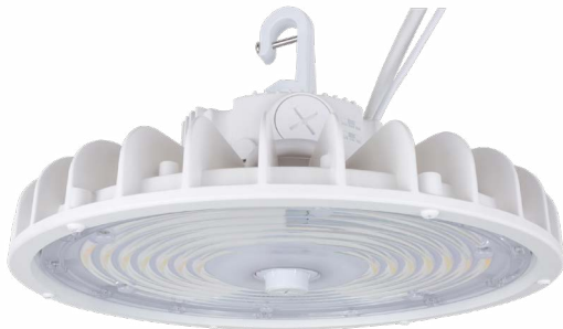
180W/ 200W/ 240W