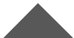
End caps (B)