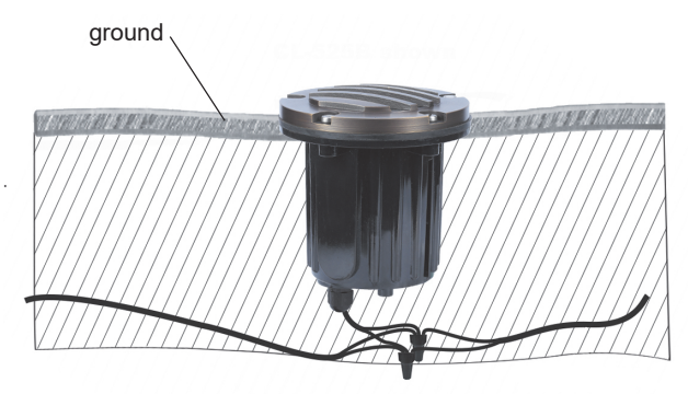
Note: LFB-W02 shown, others are similar.