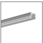
PDS4-ALU Extrusion Ref: B1718