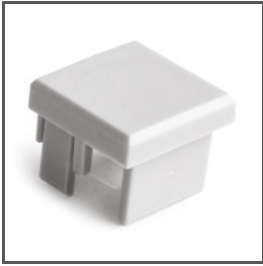
END CAP M-K C24216C02