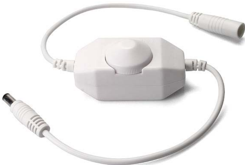
Single Color LED Dimmer

Universal single color LED dimmer can dim any 12VDC LED products from 0 to 100 percent using Pulse Width Modulation (PWM) circuit. Knob control for full intensity adjustment range. Maximum Load is 2 Amps, has Male and Female 5.5mm barrel power connector for connecting in-line with our CPS series Power Supplies.